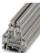
Double-level terminal block, with preassembled resistors

Component terminal block - UKK 5-2R/NAMUR - 2941662