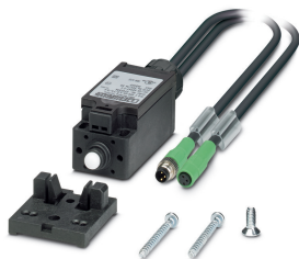
Door position switch with 1 m cable with M8 plug and 0.6 m cable with M8 socket (Snap-in), including mounting accessories

Please be informed that the data shown in this PDF Document is generated from our Online Catalog. Please find the complete data in the user's documentation. Our General Terms of Use for Downloads are valid ( http://phoenixcontact.com/download )