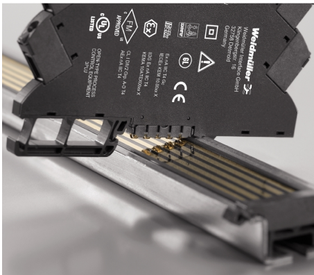
Power supply via CH20M DIN rail bus