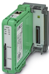
Head station for basic system functionality, no monitoring of PROFIBUS networks

Please be informed that the data shown in this PDF Document is generated from our Online Catalog. Please find the complete data in the user's documentation. Our General Terms of Use for Downloads are valid ( http://phoenixcontact.com/download )